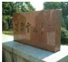
stone inscription (above), calligraphy (left)