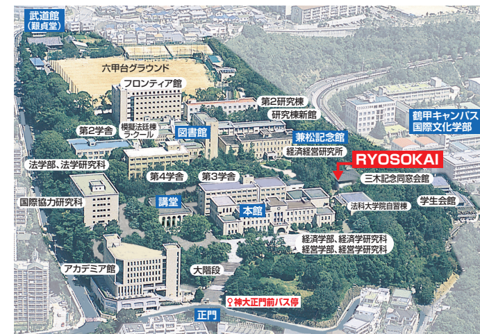
Bird's eye of Rokko-dai Campus (RYOSOKAI is shown in RED)